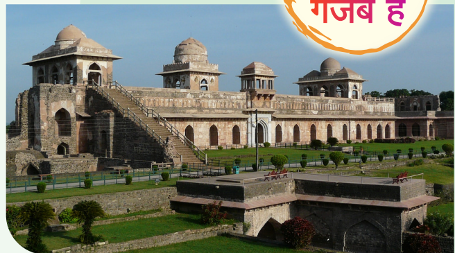
MANDU (99 km)