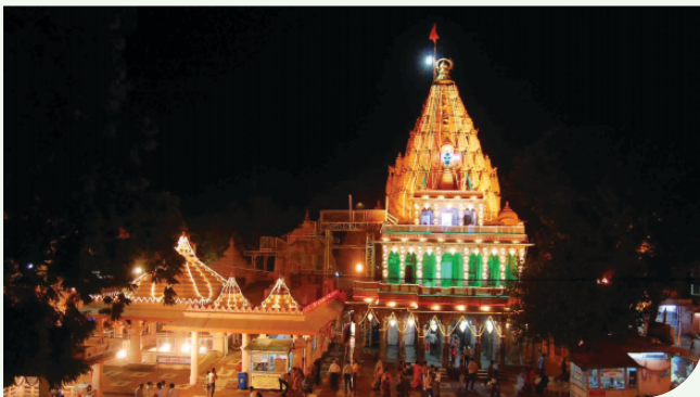
MAHAKALESHWAR, UJJAIN (55 km)