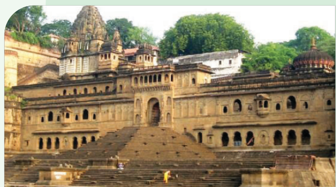
MAHESHWAR (91 km)